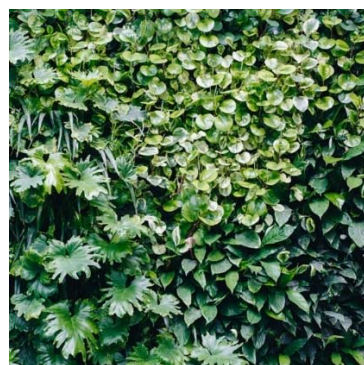
Woolworths, Crows Nest, NSW by Junglery. South east facing commercial street front green wall