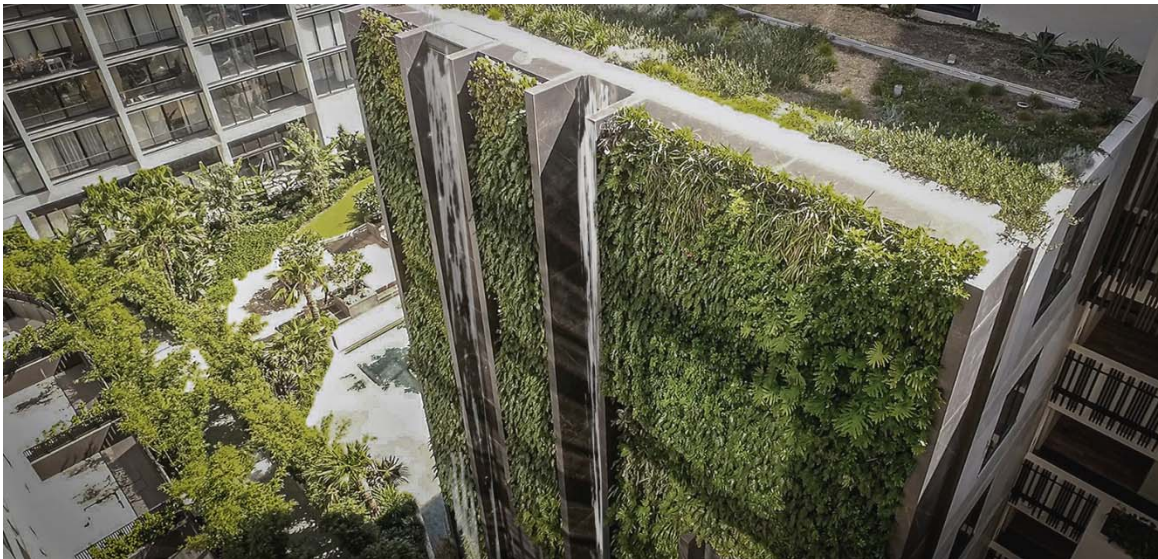
Waterfall by Crown Group. 8 story high Green Wall design and documentation by Taylor Brammer Landscape Architects with Junglery (photo of installed and completed project)

When considering the use of established green wall modules, specialist contractors, irrigation, appropriate plant selection and appropriate ongoing maintenance, the green wall as shown has the opportunity to contribute to the street front positively for a significant period of time. Refer examples following